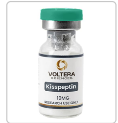
KSPTN 10mg - KSPTN10-06152026