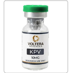
KPV 10mg - KPV10-06152026