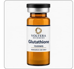
Glutathione 1500mg - GT1500-05042026