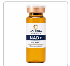
NAD+ 1000mg - NAD1.05.15.2026